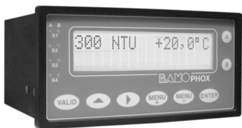
Panel mounting (main device)