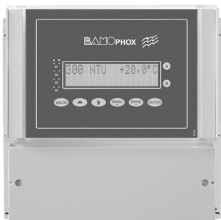
Wall mounting (main device)