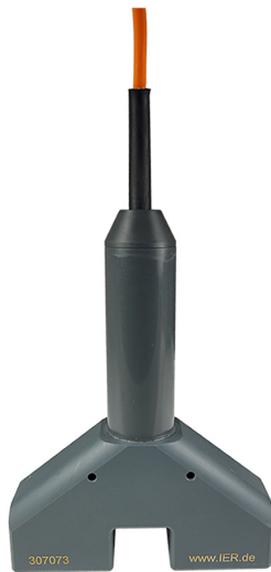
TURBISWITCH CP2 Z0