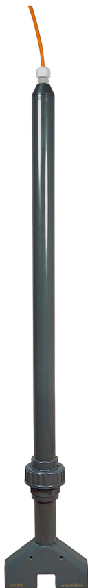
TURBISWITCH CP2 ZR