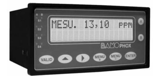
Panel mounting (main device)