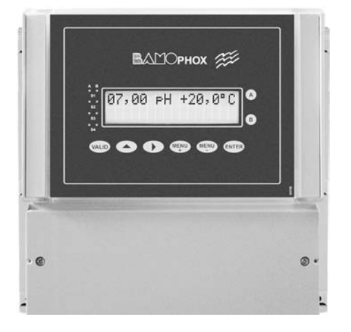
Wall mounting BAMOPHOX 106