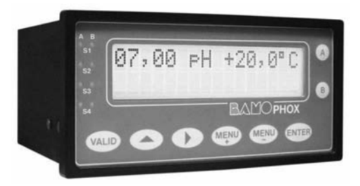
Panel mounting BAMOPHOX 106